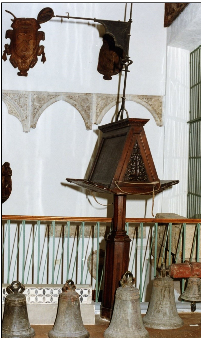
The lectern on display in the Volterra Diocesan Museum

The lectern is supported on an octagonal wooden stand and has an iron 'weathercock' for holding a lamp. The height is 208 cm without the weathercock; the panels are 98 x 62 cm, the base of the lateral panels is 53 cm, the height of the weathercock is an additional 140 cm.