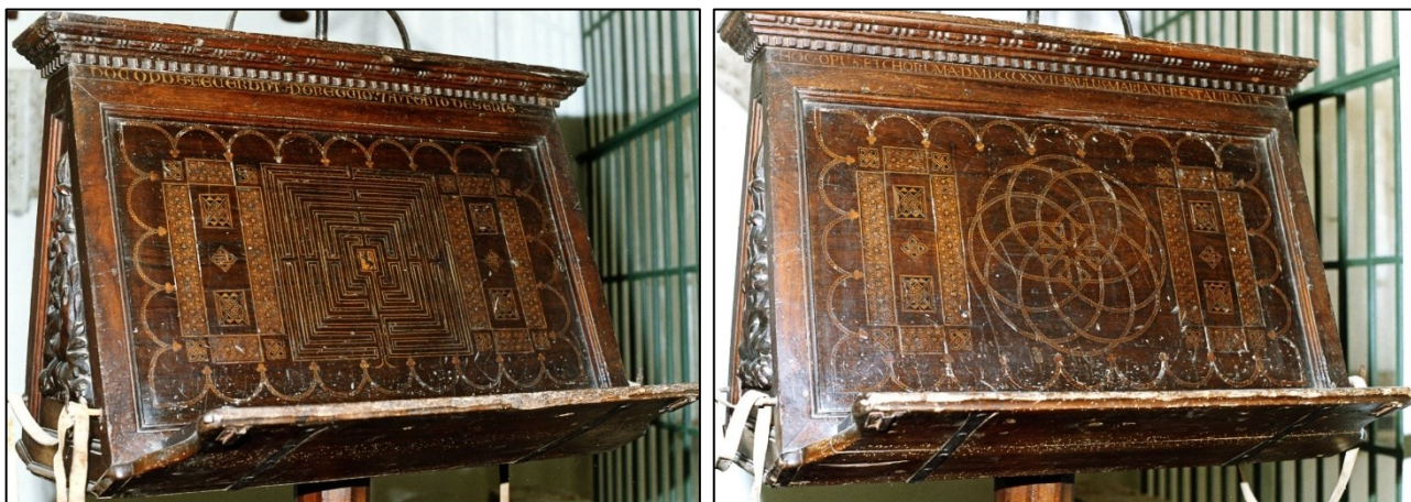
The two sides of the Volterra lectern

Both the panels are decorated with wooden inlays: on one side is the labyrinth; the other is a geometric plait generated by eight circles