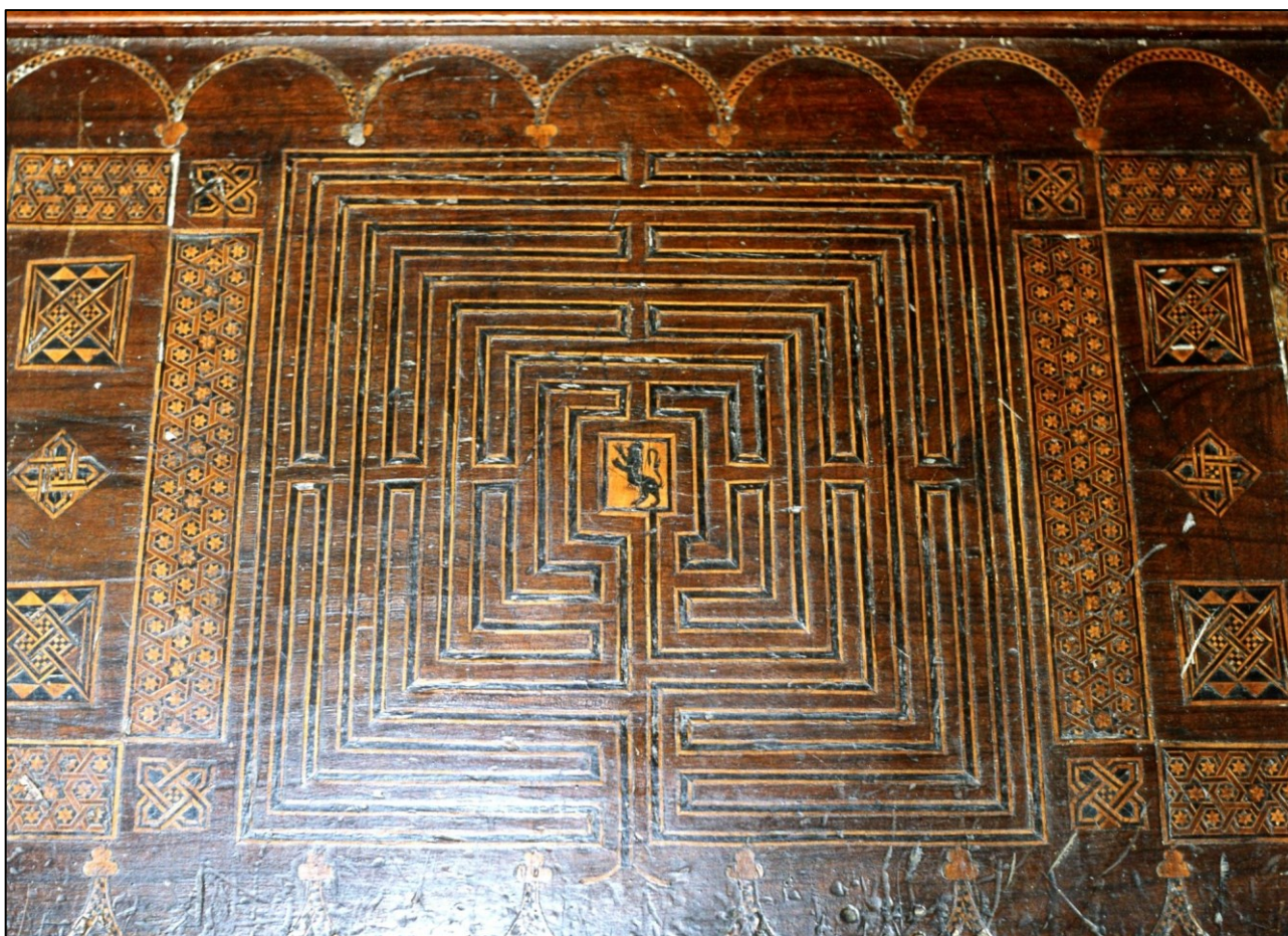
Detail of the labyrinth on the Volterra lectern. 35 centimetres square and of the familiar and widespread ‘medieval type’ with 11 circuits, the central goal is occupied by a rampant lion or centaur.

The labyrinth is square in design, with sides of 35 cm. It has an 11-circuit structure, the same design as Chartres and Lucca. The path is dark and the “walls” are marked in lighter inlay. A rampant figure is placed in the centre. Its identification is quite hard because of its small size and inaccurate realisation. It could be a lion or a centaur.