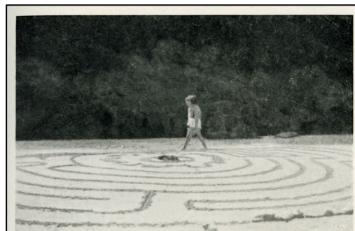
Fig. 141. Sea-Side Sand Maze.

Mazes and Labyrinths – A General Account of their History and Development. Original edition and cover, Labyrinthos Archive