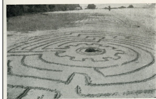
Fig. 142. Sea-Side Sand Maze.