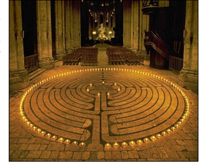
Pavement labyrinth, Chartres Cathedral, France