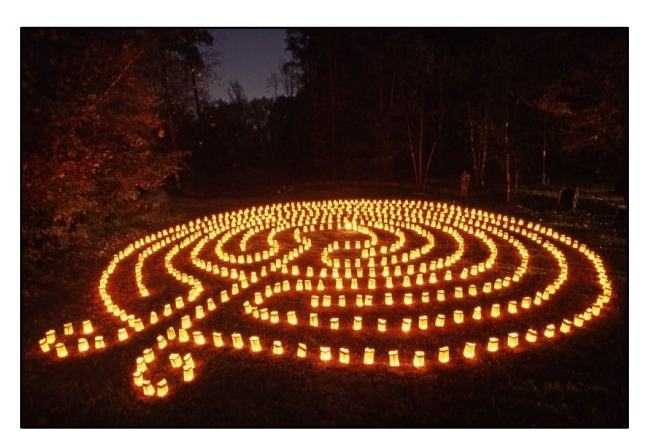
Modern Ceremonial Labyrinth, Atlanta, USA