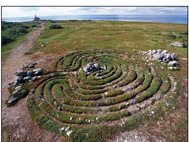
Stone labyrinth, Zaiatsky, Arctic Russia