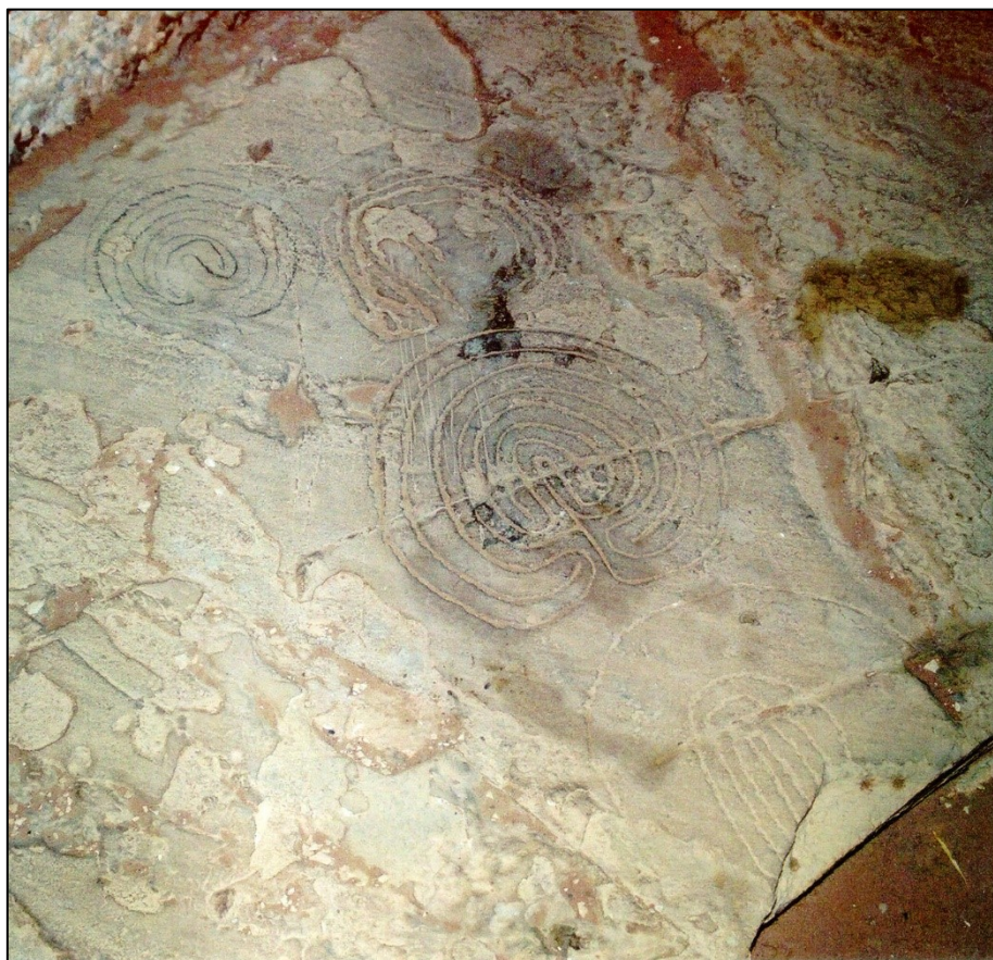
The labyrinths on the rockface at Petra, Jordan.