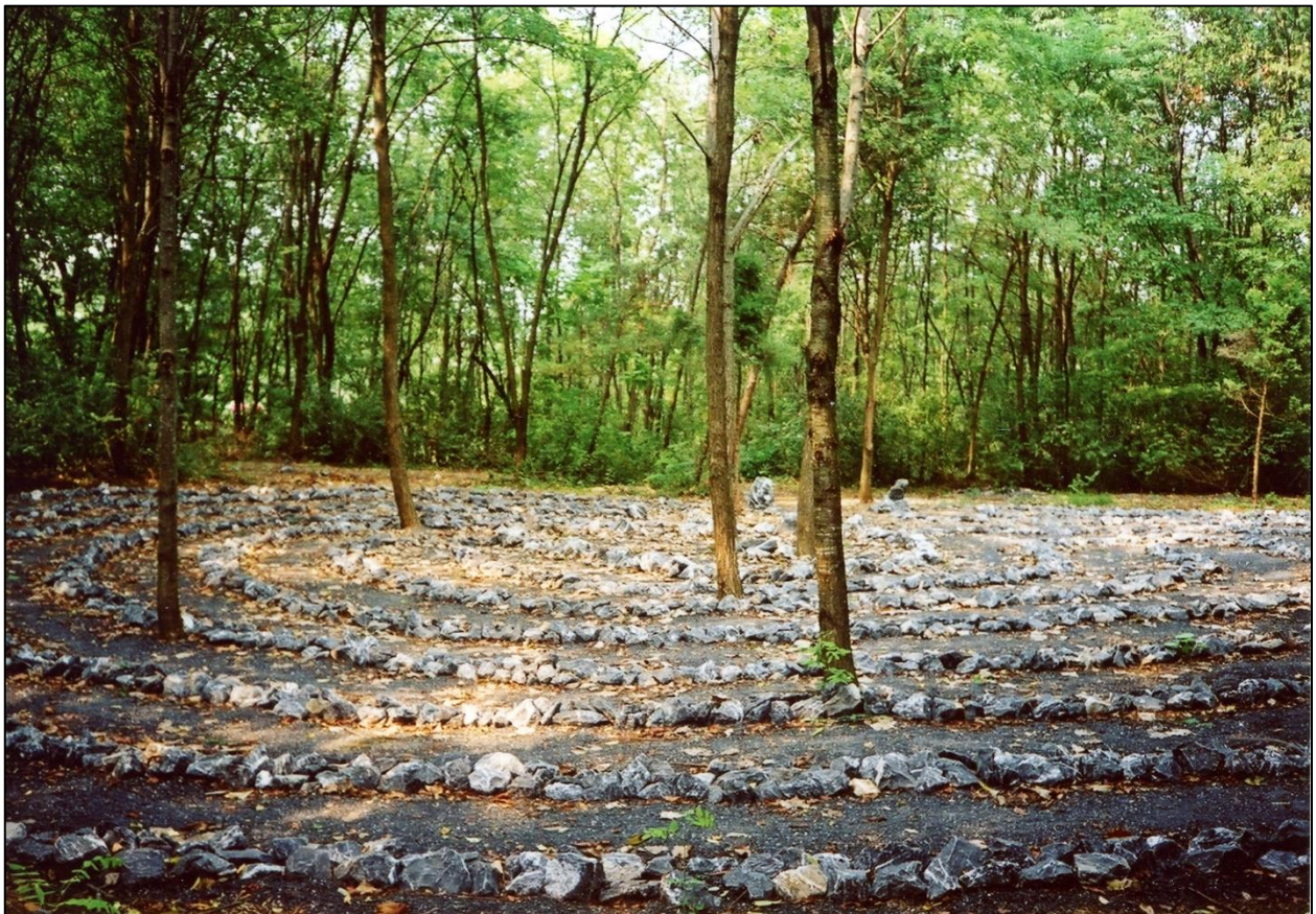
The labyrinth at JMU, Harrisonburg, Virginia.