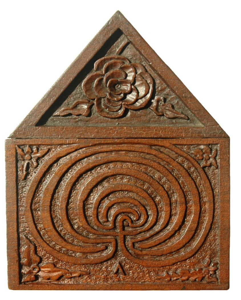
Hand-carved wooden plaque with labyrinth and "Glasgow Rose" design.

Although this item could conceivably date from anywhere between the 1890s to the early 1930s, the combination of style and the specific labyrinth design might suggest a date from somewhere around the middle of this range, and it was surely made in Scotland, perhaps in Glasgow, but maybe in Aberdeenshire?