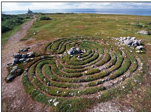
Stone labyrinth, Zaiatsky, Arctic Russia