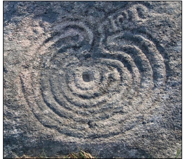
Prehistoric labyrinth petroglyph, Mogor, Spain