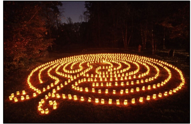
Modern Ceremonial Labyrinth, Atlanta, USA