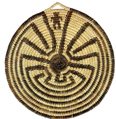
Man in the Maze Basket, Arizona, USA