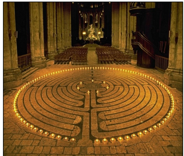
Pavement labyrinth, Chartres Cathedral, France