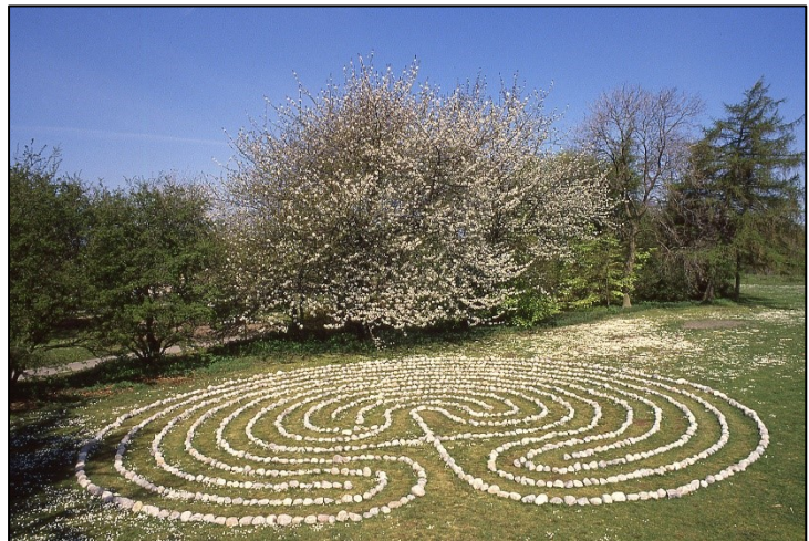
Valbyparken Labyrinth, Copenhagen, May 1995

By good fortune, Jeff Seward photographed one of these, the stone labyrinth, 17 metres in diameter, built in Valbyparken, Copenhagen, shortly after completion on a glorious sunny day in May 1995. The photos of this labyrinth have now been reproduced in many books and magazines, and it is now well known, worldwide. The largest of my creations you will find at the Labyrinthia activity park, south of Silkeborg, in Jutland, 22 metres in diameter, it was constructed from 1388 large boulders. 4