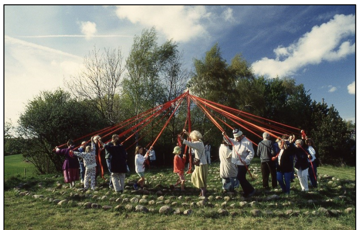
Maypole Dancing on the labyrinth at Tulstrup, Denmark, May 1995

During 1975 I began lecturing on the subject of labyrinths and mazes in my evening school adult classes, and together we built a Trojaborg stone labyrinth, 14 metres in diameter, in May 1976 on the property of two of my pupils from Tulstrup, to the north of Copenhagen. Between 1976 and 1995 we held 15 gatherings, for old friends and labyrinth enthusiasts alike, and successfully experimented with dancing the labyrinth with red ribbons around a Maypole. I am told we were the first people to practice this dance, and our original red ribbons are still used from time to time on other labyrinths in Denmark.