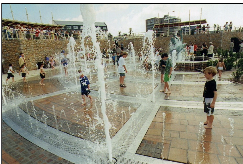
The Jersey Water Maze.

The Jersey Water Maze, opened in July 1997, is a splendid hi-tech example of the type, located in St Helier, on the island of Jersey, off the northwest coast of France. Computer controlled pumps maintain multiple 'walls' of water, defining the plan of the maze by spraying jets up through grilles set into an otherwise flat paved area. The same grilles collect the water for re-circulation. 'Walls' are turned on and off in a programmed sequence, allowing access to subsequent cells within the sectioned, concentric circuits.