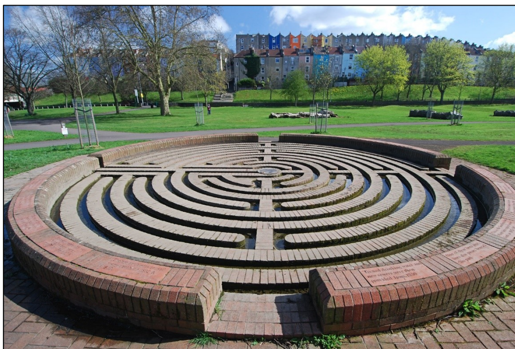
The Bristol Water Maze.

Although the notion has been around for some time, as the recent discovery of a water maze at Greenwich in the early 1600's attests, surprisingly few examples have been recorded since that time. The Greenwich maze has long gone, as has Minotaur Design's "Beatles Maze," an innovative water maze installed at the Liverpool Garden Festival in England in 1984. It featured a 51 foot (15.5 metres) yellow submarine at the centre of an apple shaped brick pathway set in a large pond. The only permanent water maze in Britain, until recently, was the example in Victoria Park, Bristol. Also created in 1984, and more a piece of brick sculpture than a practical maze, its design is based on the late 14th century labyrinth roof boss in nearby St. Mary Redcliffe Church.