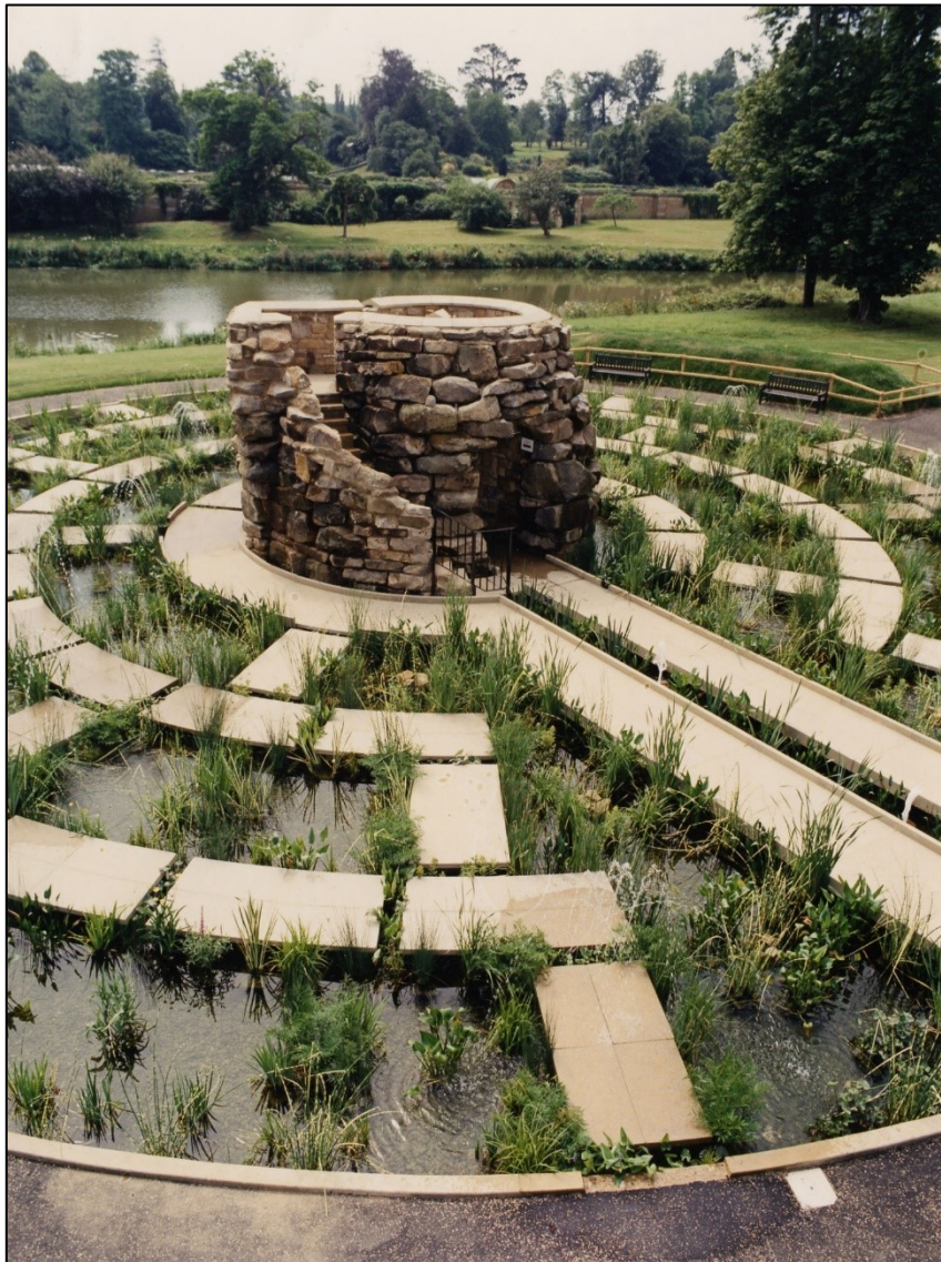
The Hever Castle Water Maze.